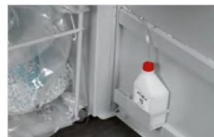
INTEGRATED AUTOMATIC OILER