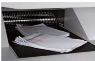
ELECTRIC CONVEYOR BELT

輸送帶送紙系統，安穩又輕鬆 重量級精鋼齒輪及鏈帶驅動 24小時高級馬達 炭合金鋼刀，可碎普通釘書針及萬字夾 輕觸面板操作及LED顯示機器狀況 滿載及開門停機 塞紙自動退回 自動刀具加油裝置，清除紙屑塵粉 大型堅固鋼櫃，底部4滑輪 滑輪紙屑箱，470L膠袋 或 兩個235L膠袋