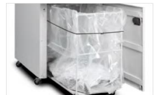
ADJUSTABLE REMOVABLE TROLLEY