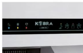
TOUCH SCREEN PANEL

Convenient conveyor belt for easy feeding of material to shred.