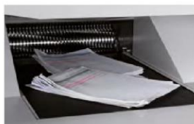
ELECTRIC CONVEYOR BELT

Convenient conveyor belt for easy feeding of material to shred.