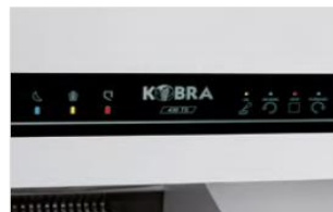
TOUCH SCREEN PANEL