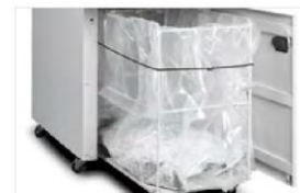
ADJUSTABLE REMOVABLE TROLLEY

It eliminates the need to manually lubricate the unit, ensuring maximum reliability, efficiency and capacity.