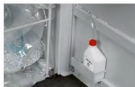
INTEGRATED AUTOMATIC OILER

Just touch the controls to activate the machine functions.